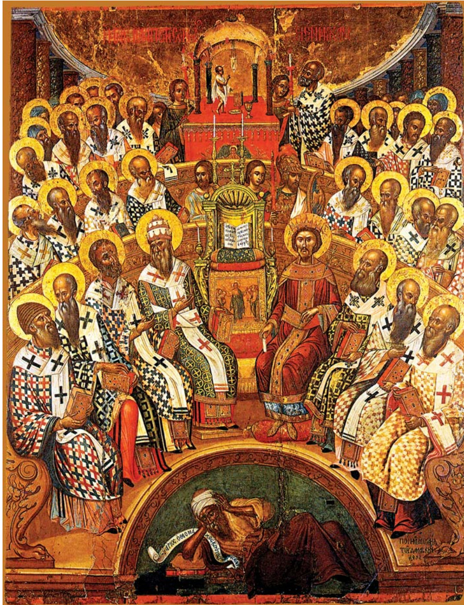
THE FIRST ECUMENICAL COUNCIL