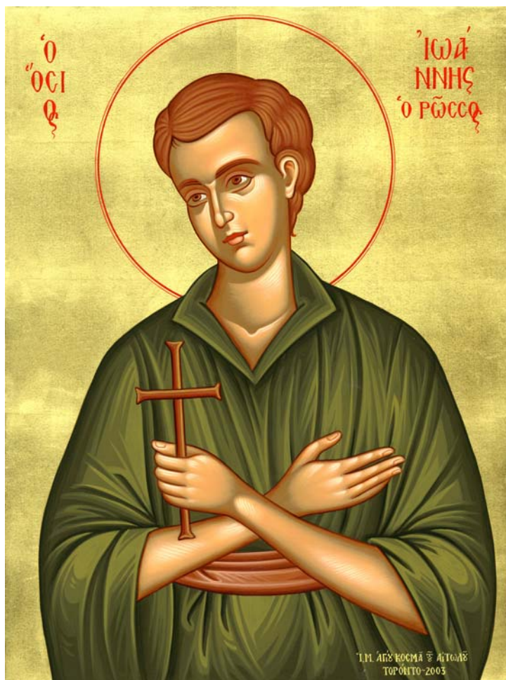
SAINΤ JOHN THE RUSSIAN

friend. (Δ) Where-fore, do thou be-seech Him that (B) our souls be saved.