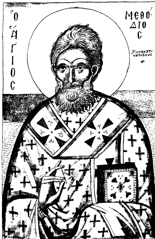
SAINTE METHODIUS THE CONFESSOR