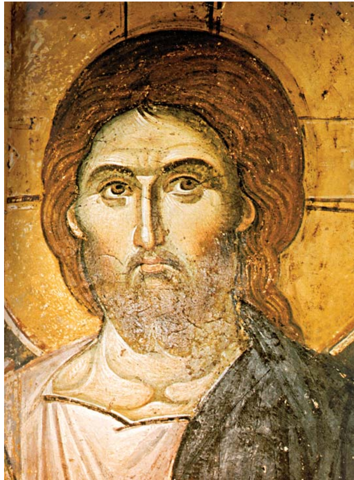
Fresco from the Protaton of the Holy Mountain