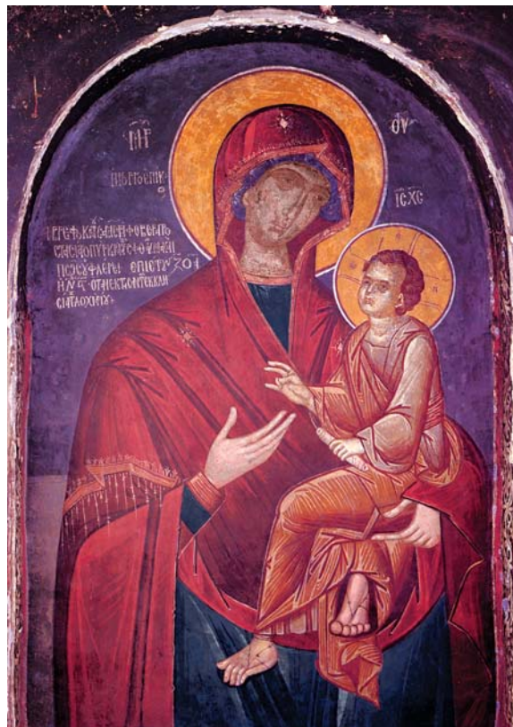
of Docheiariou Monastery on the Holy Mountain