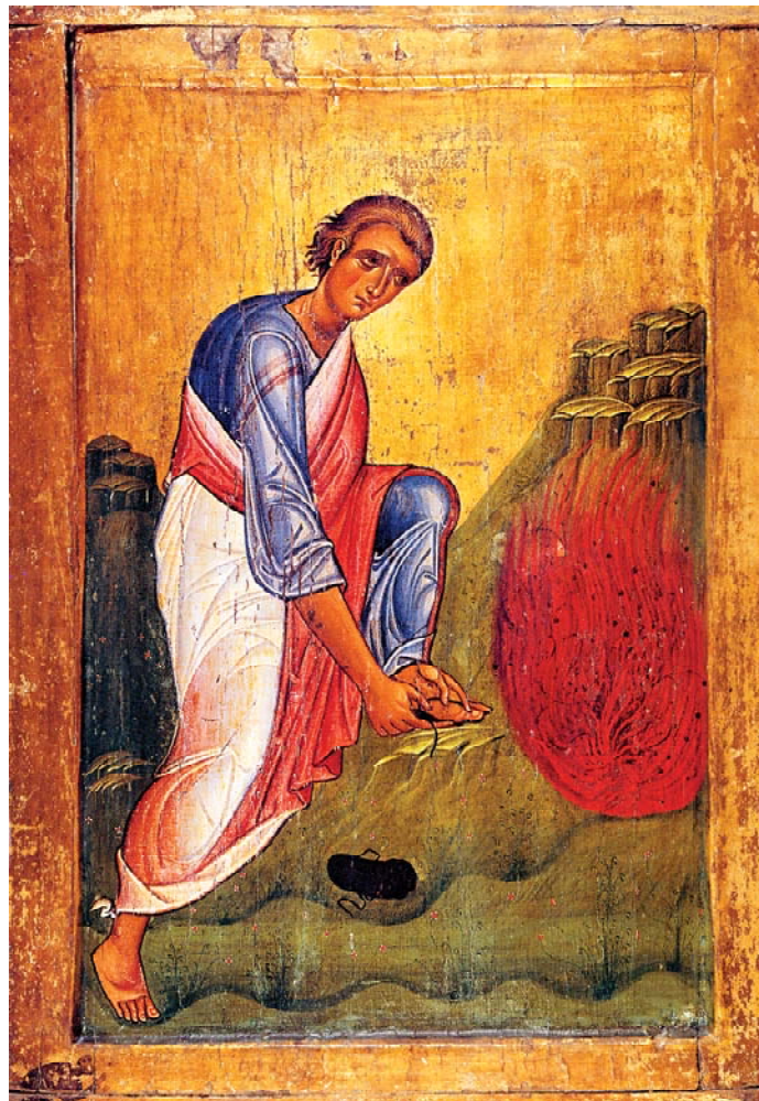
THE PROPHET MOSES