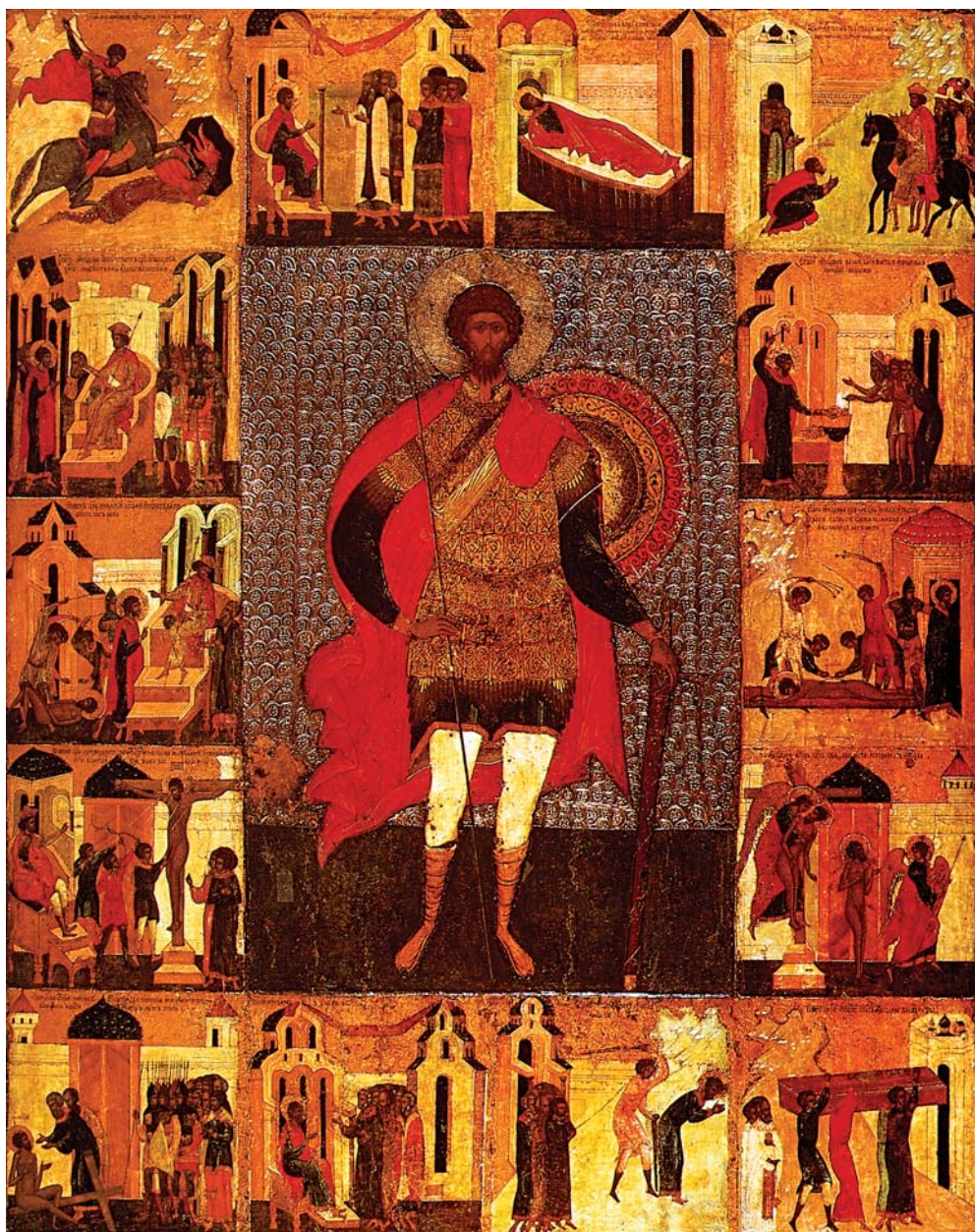
SAINT THEODORE THE TYRO