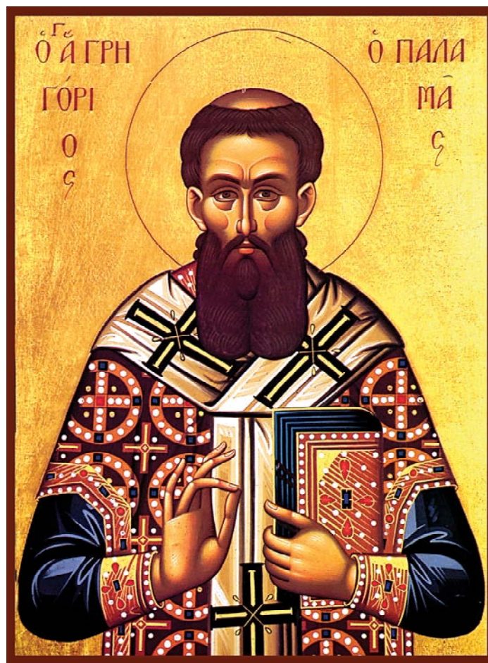
SAINT GREGORY PALAMAS THE WONDERWORKER