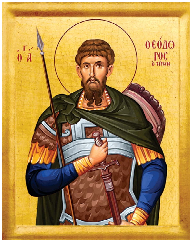
SAINT THEODORE THE TYRO