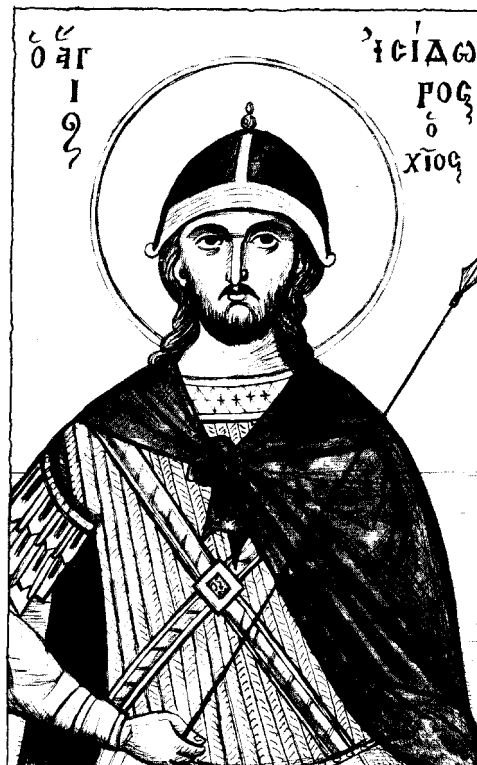
SAINT ISIDORE OF CHIOS