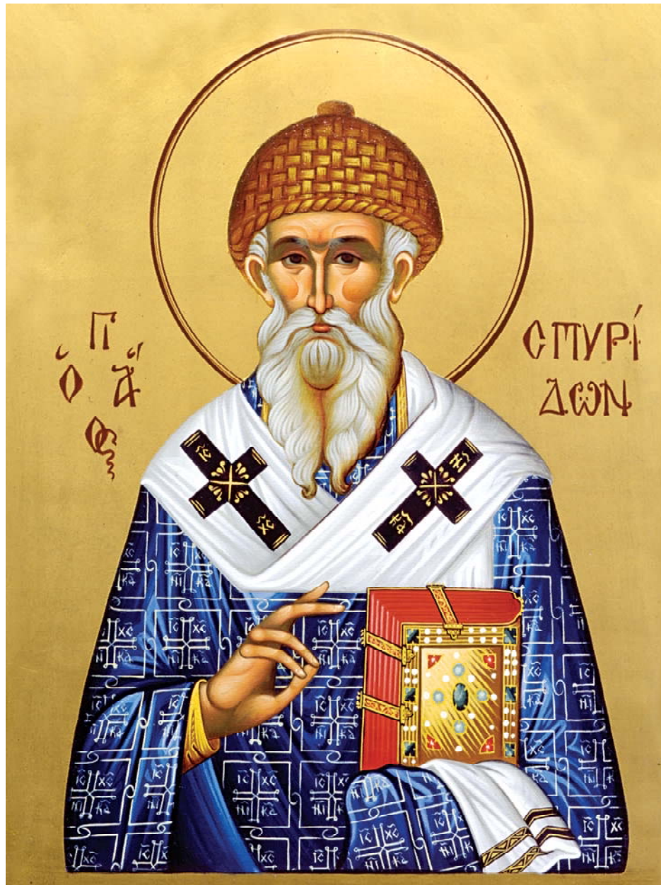
SAINT SPYRIDON THE WONDERWORKER