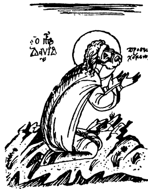
The Prophet David Praying