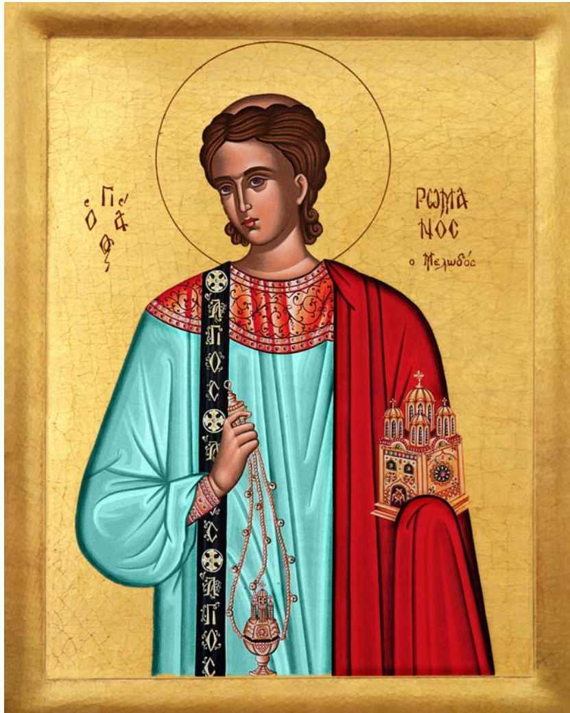
ST. ROMANOS THE MELODIST