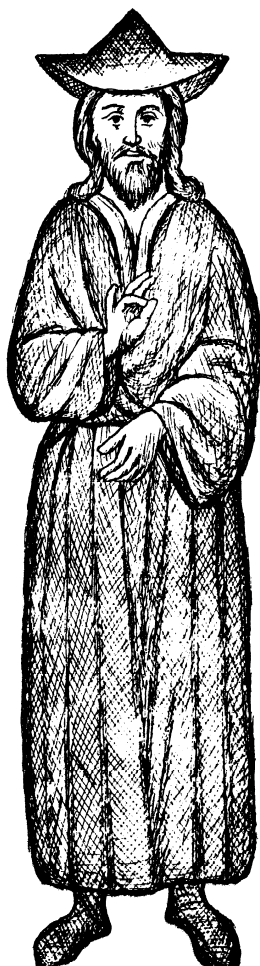
St. John Koukouzelis Copy of a miniature contained in Codex 178 of the Monastery of Lavra